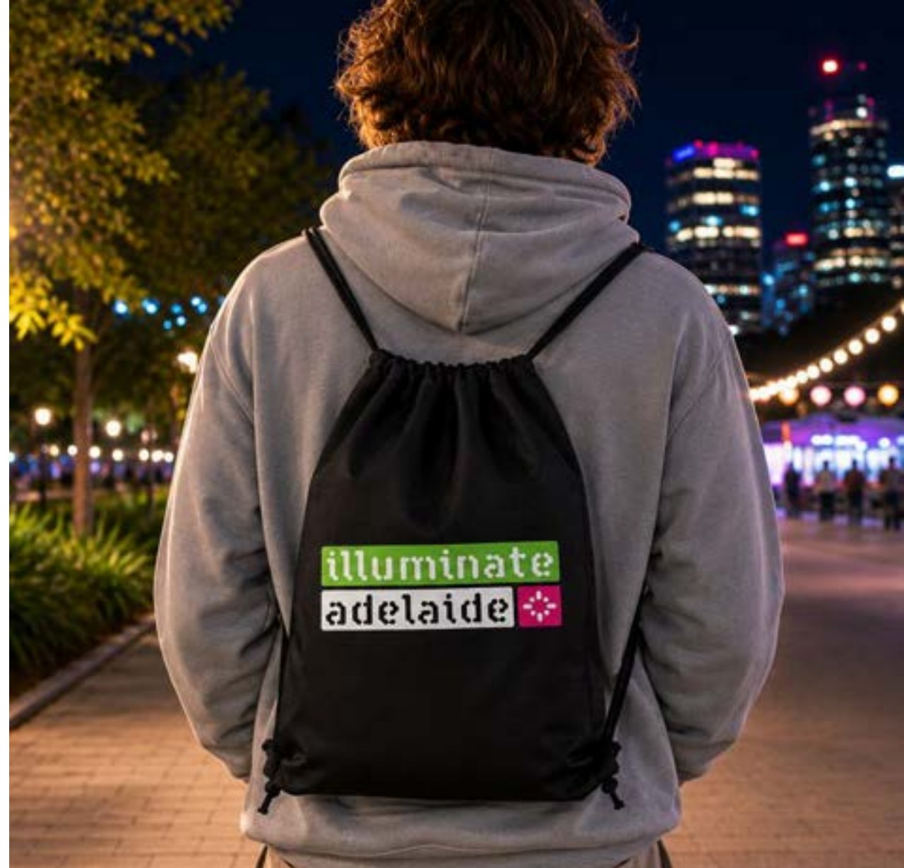
Alt Text: A person in a hoodie walks through a vibrant, illuminated cityscape at night with a "Illuminate Adelaide" backpack, creating a lively atmosphere.

You are welcome to bring your own sensory aids to Digital Abyss .