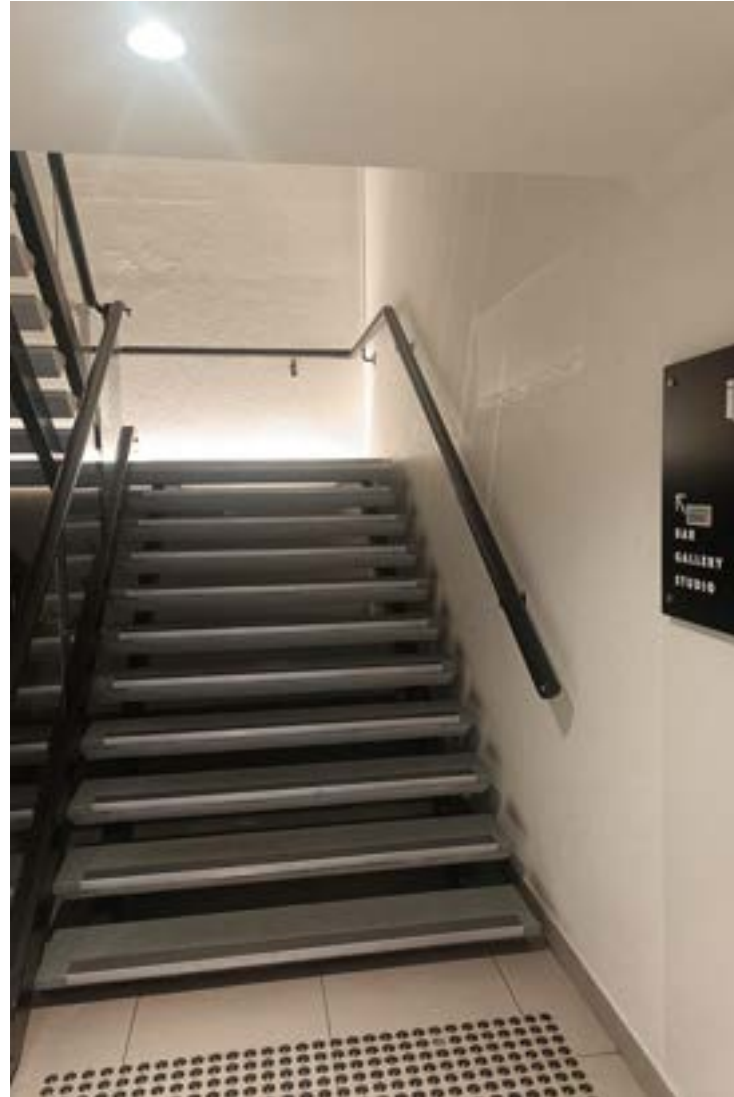
Alt Text: A staircase with grey steps and a handrail, located next to a wall-mounted sign indicating "Bar, Gallery, Studio."

They have a gripped surface, and a handrail on either side.