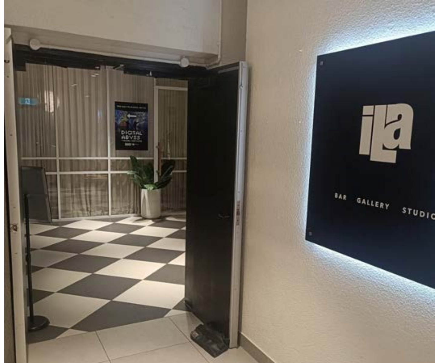
Alt Text: A doorway leading into a space with a sign that reads "ILA" and lists "Bar, Gallery, Studio," featuring a black and white checkered floor.

From this foyer space, entry to Digital Abyss is via the doors on the left, and entry to the ILA Bar on the right.