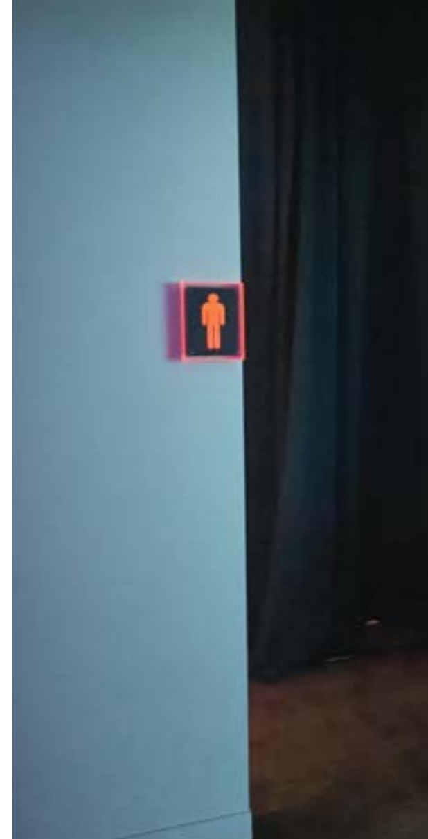
Alt Text: A wall corner with a men's restroom sign and a curtain.