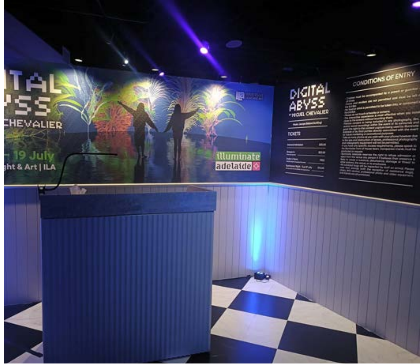
Alt Text: The Box Office counter for the "Digital Abyss" exhibition by Miguel Chevalier, featuring colourful lights and a modern setup with a checkered floor.

At Relaxed Sessions there will be less people.