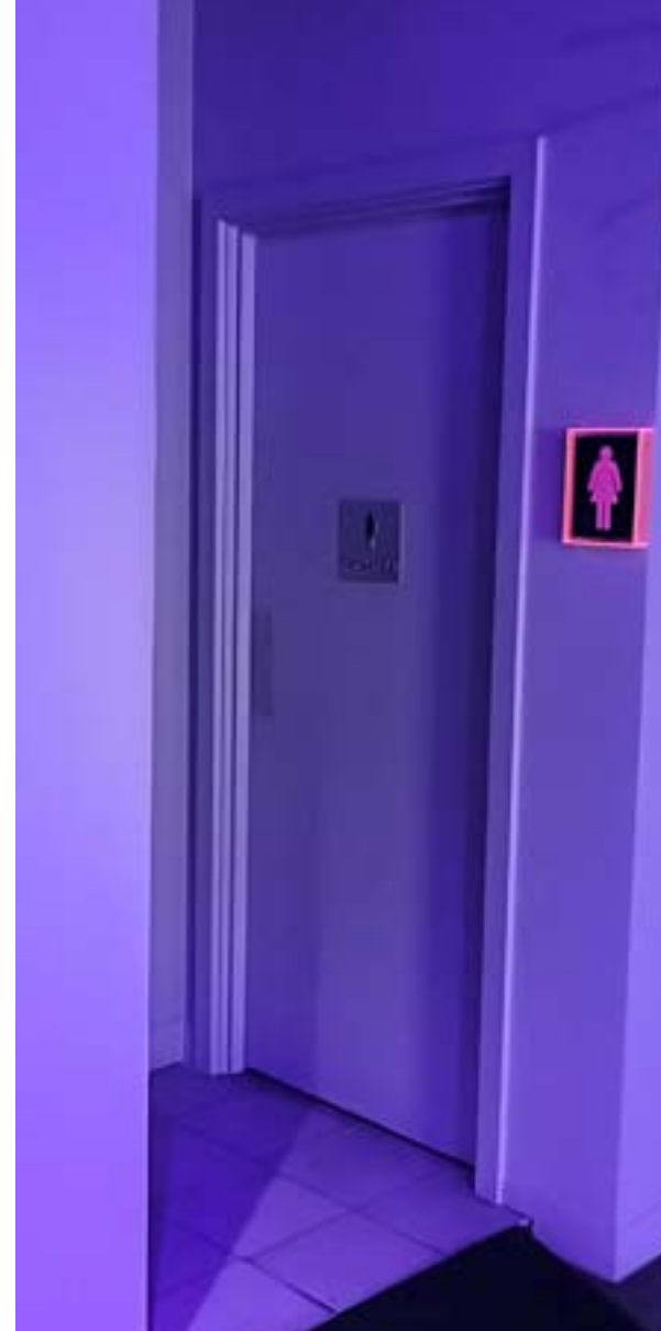
Alt Text: A door with a women's restroom sign.