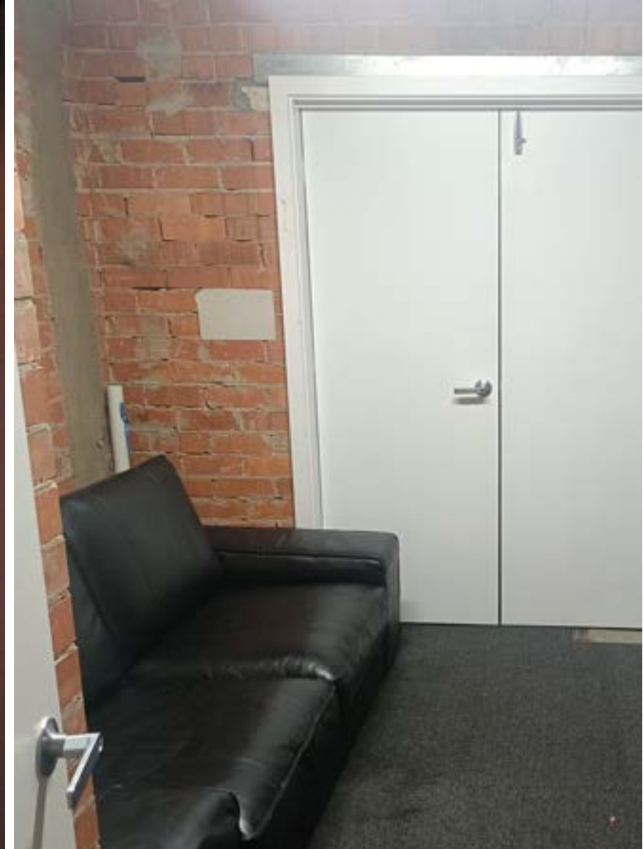
Alt Text: A small room with a black couch, a closed double door, featuring exposed brick walls and carpeted flooring.