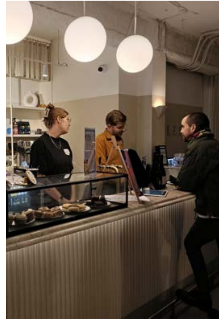
Alt Text: The ILA Bar counter, displaying pastries and drinks, with two staff members engaged with a customer.