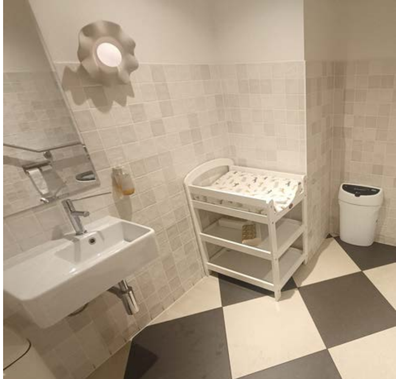
Alt Text: Interior view of the accessible bathroom at ILA, with a sink, mirror, and baby change table.

Food and beverage is available for purchase within the ILA Bar located on level 1.