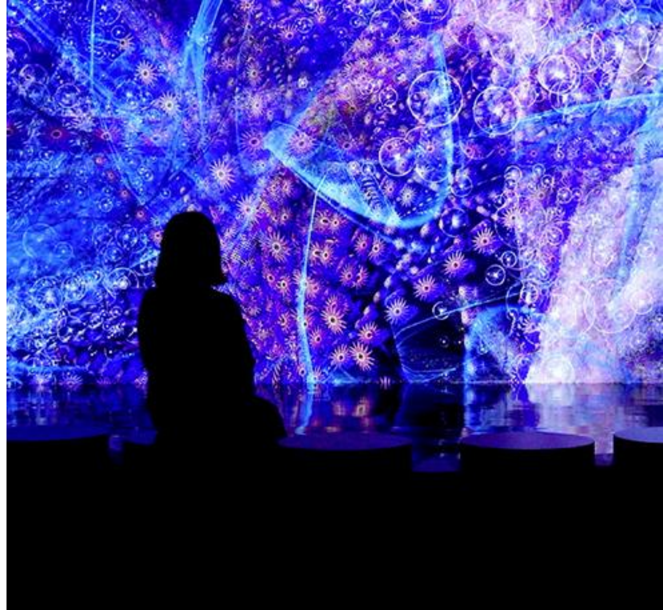
Alt Text: A silhouette of a person sitting on a bench in front of a vibrant, colourful light display featuring shades of blue and purple with abstract patterns.

Relaxed Sessions are available with reduced capacity and lowered sound levels. Find more details on page 9.