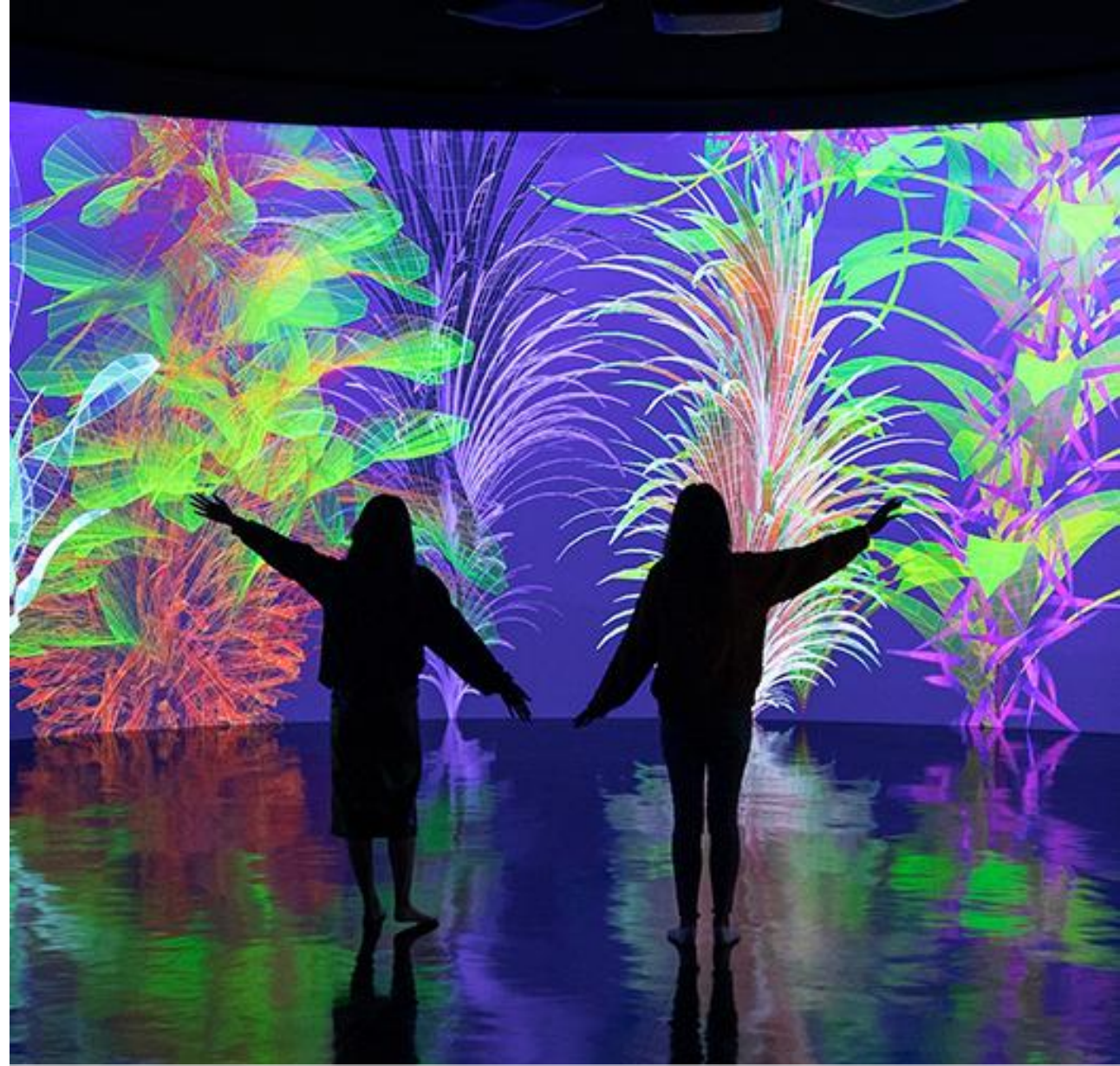
Alt Text: A vibrant scene where two people with outstretched arms stand in front of a vivid digital display of colourful, abstract plants.