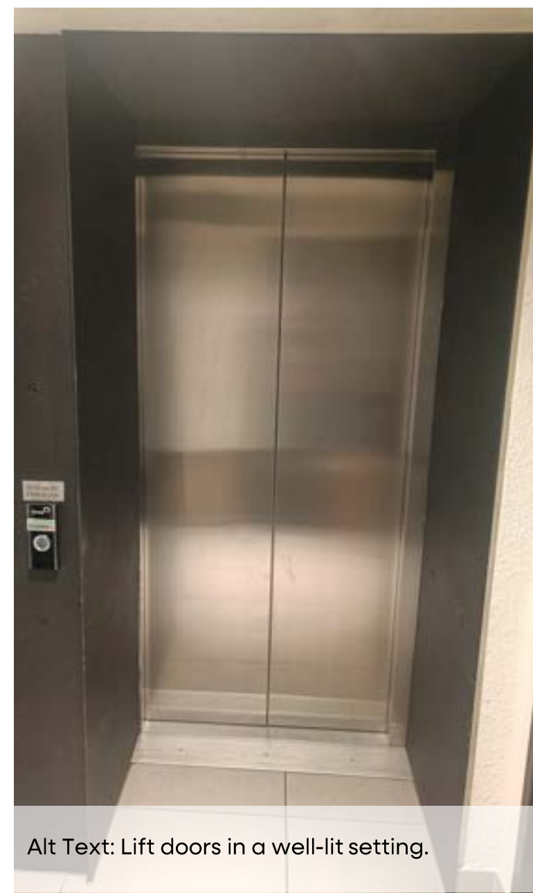
Alt Text: Lift doors in a well-lit setting.