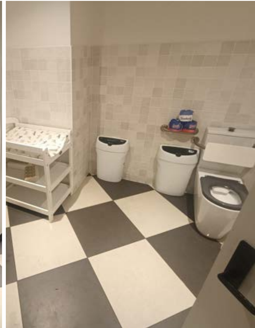
Alt Text: Interior view of a bathroom with a toilet, bins, and baby change table.