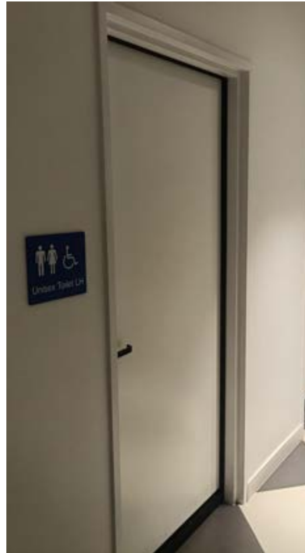
Alt Text: A white door with a sign reading "Unisex Toilet" alongside a wheelchair accessible symbol.

There are baby changing facilities here.