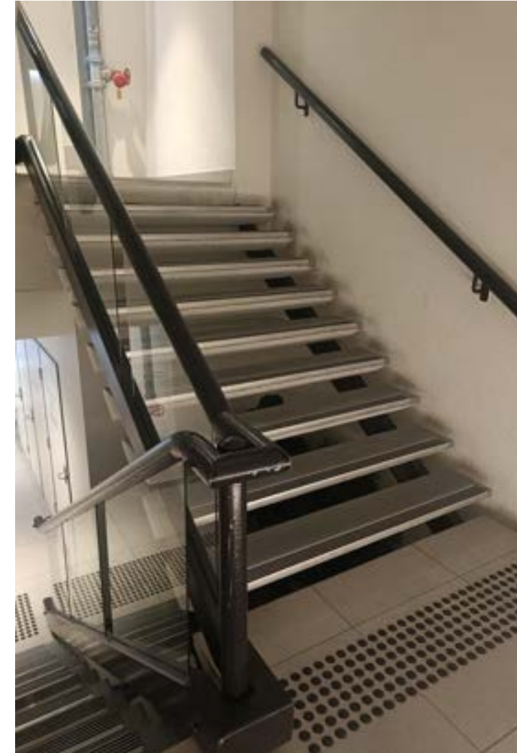
Alt Text: A stairway with a glass railing and metal steps, leading upwards with a tiled floor below.