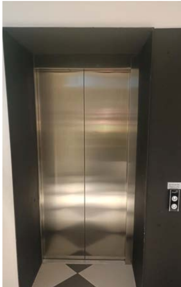
Alt Text: A modern elevator with metallic doors and a control panel beside it, set against a geometric floor design.

Exit level 1 via the lift in the foyer space, or the stairs.