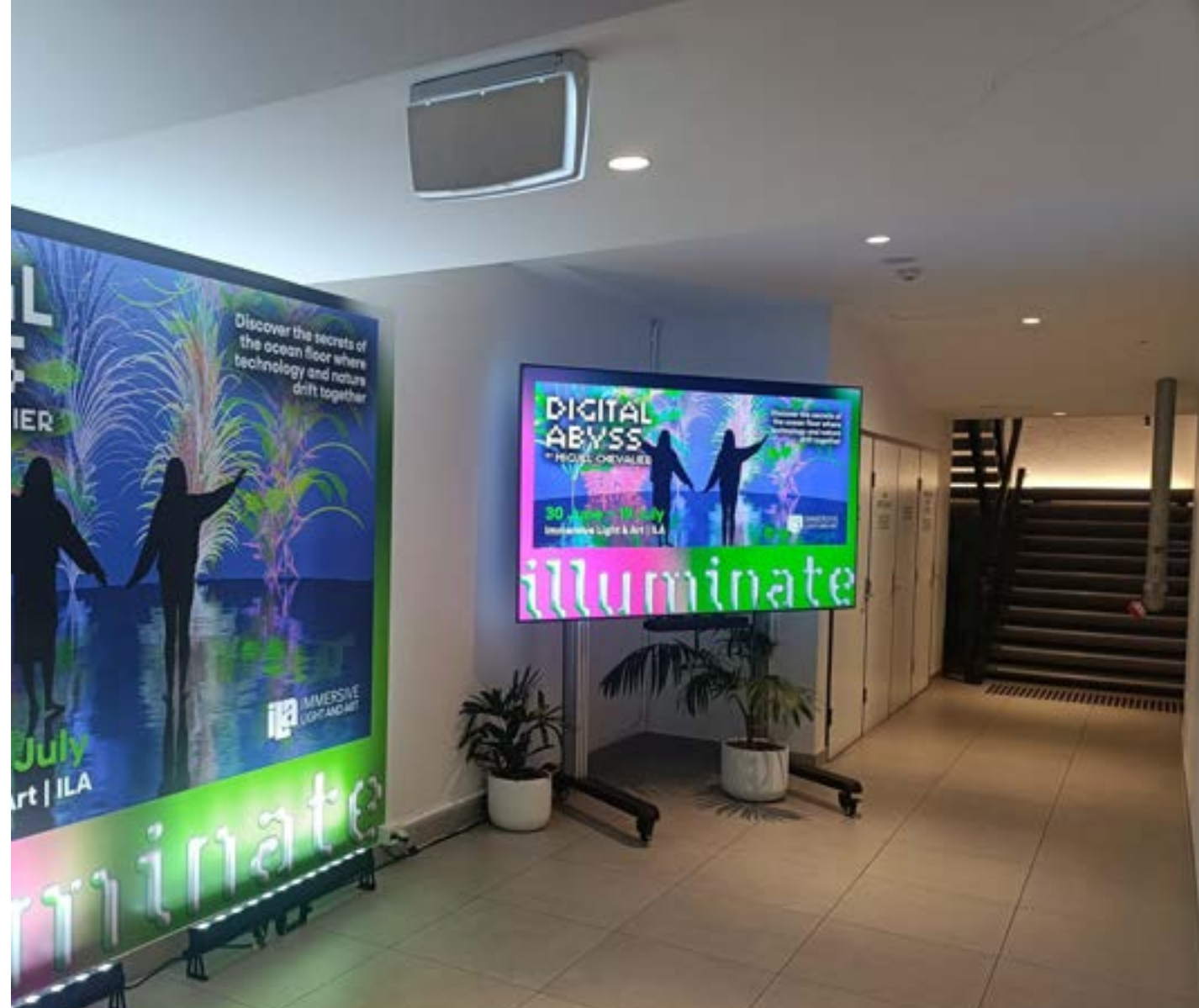
Alt Text: Colourful Digital Abyss signage on the left of a foyer, with steps at the end of the space leading up to another level. The environment is well-lit and welcoming.