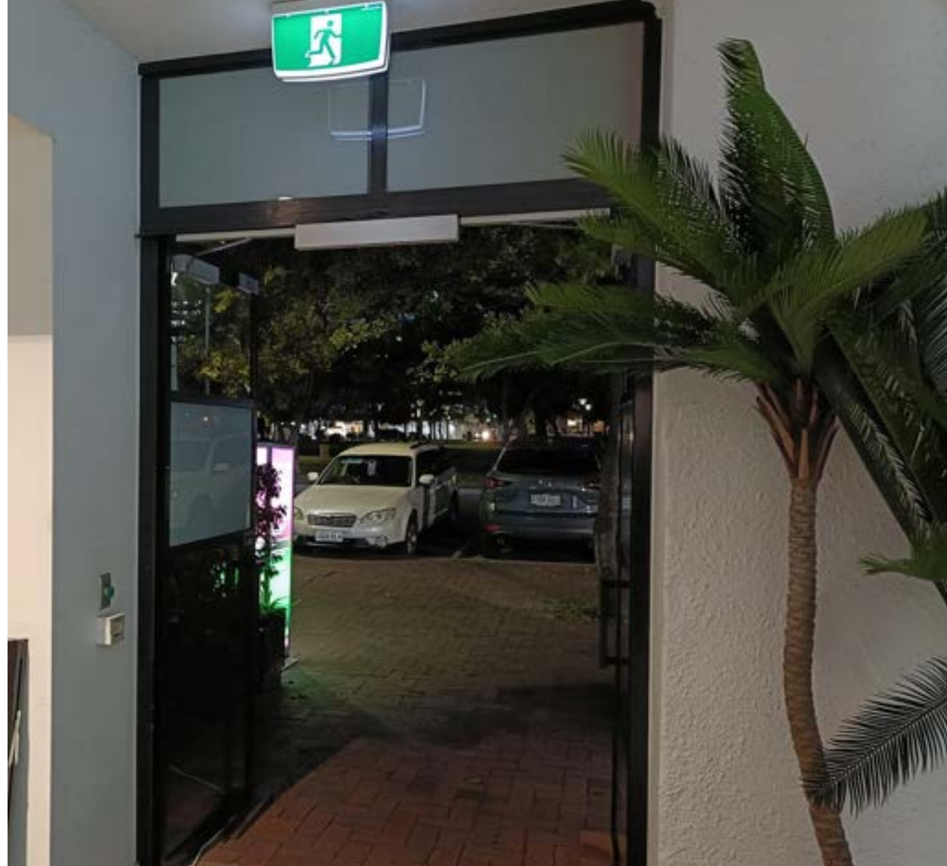
Alt Text: An entrance with a glass door leading outside, surrounded by greenery.

Exit ILA through the double doors on the ground floor.