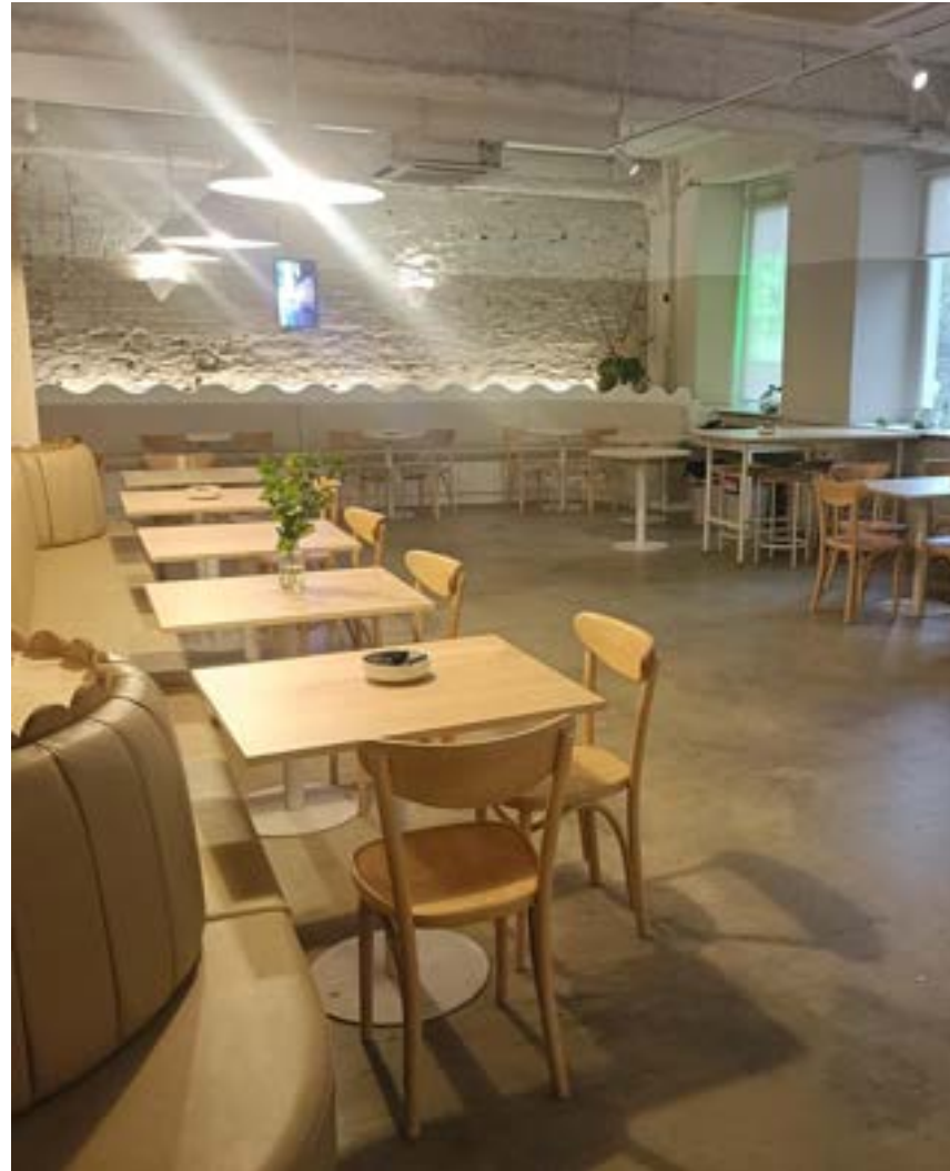
Alt Text: Interior view of the ILA Bar, featuring wooden tables and chairs, a light colour palette, and large windows.