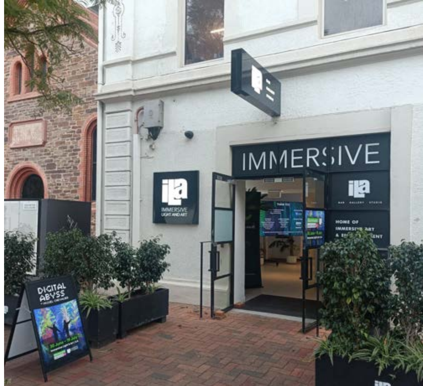
Alt Text: The image shows the entrance of ILA Immersive Light & Art, with Digital Abyss signage on the left.

There is paid street parking available immediately out the front of the venue.