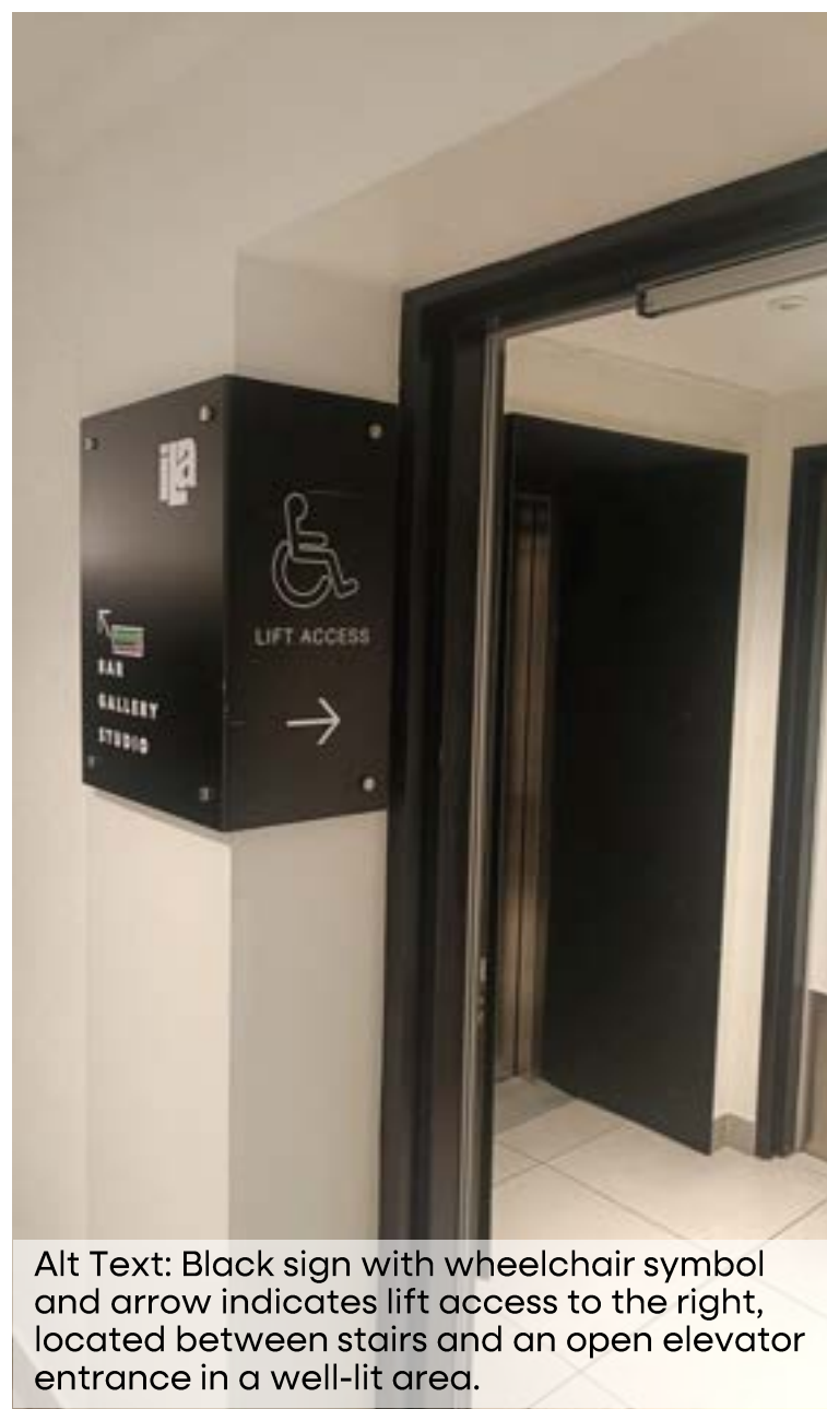
Alt Text: Black sign with wheelchair symbol and arrow indicates lift access to the right, located between stairs and an open elevator entrance in a well-lit area.

There is an 'Illuminate Adelaide' sticker on the lift button, and you will take the lift to level 1 for Digital Abyss .