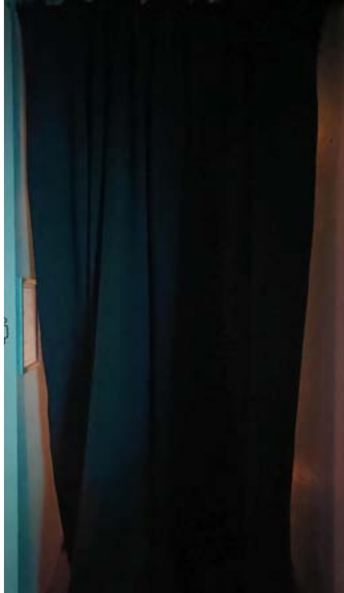
Alt Text: A partially open curtain revealing a dimly lit space behind it.