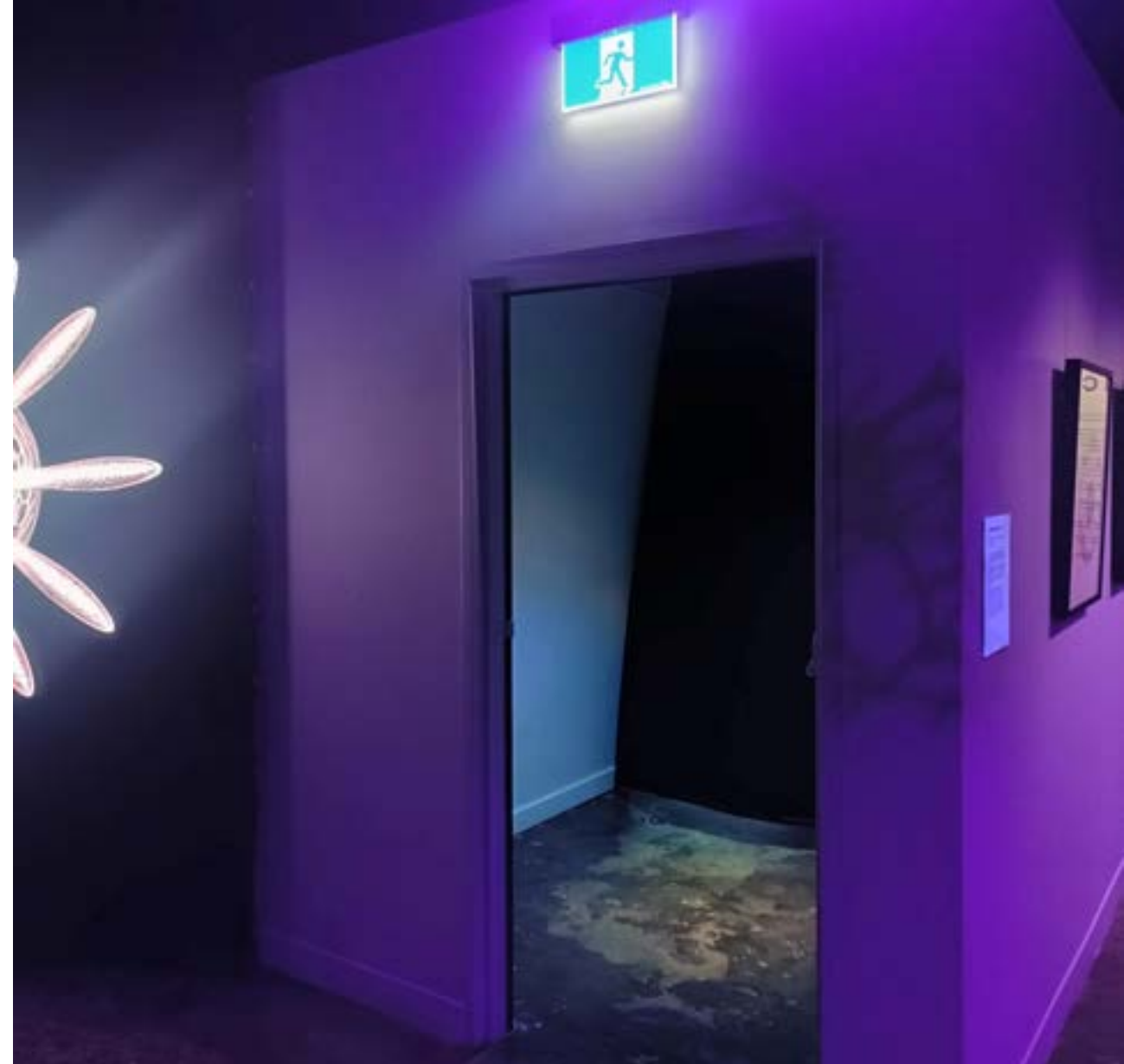
Alt Text: A doorway leading to a black curtain, illuminated by an exit sign above.

This doorway will lead you through some black hanging curtains, into the ILA Bar.