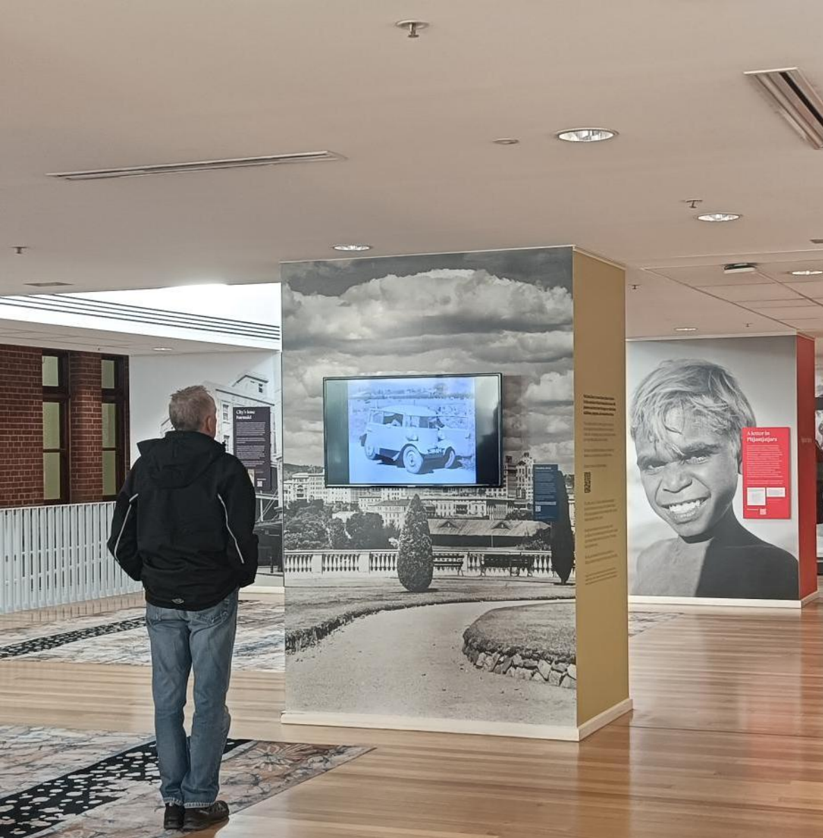
Alt Text: A man in a black jacket stands in the State Library of South Australia viewing a display featuring a vintage car photo. Large monochrome portraits and text panels are in the background.