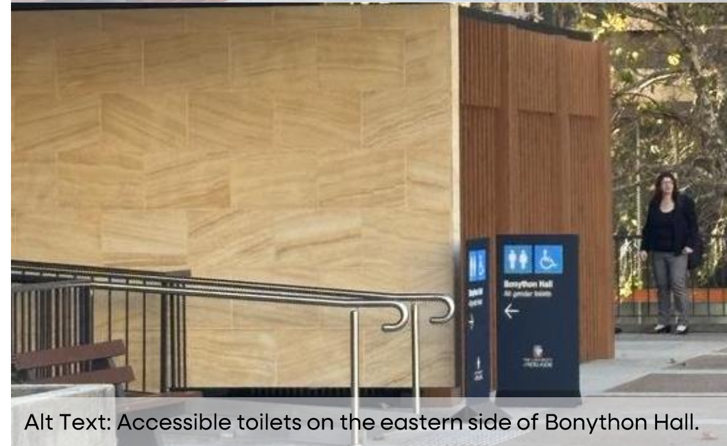
Alt Text: Accessible toilets on the eastern side of Bonython Hall.