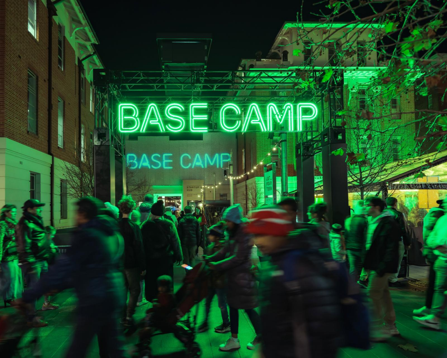
Alt Text: Many people are moving busily through the illuminated neon blue Base Camp entry archway amongst the buildings at Lot Fourteen.