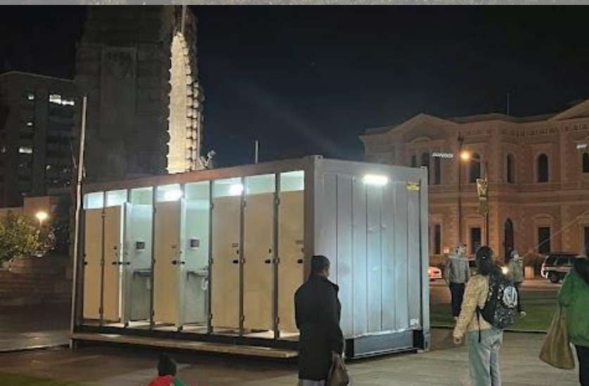
Alt Text: Outdoor portable toilets at night, next to the National War Memorial. Lit buildings in the background create an urban evening atmosphere.