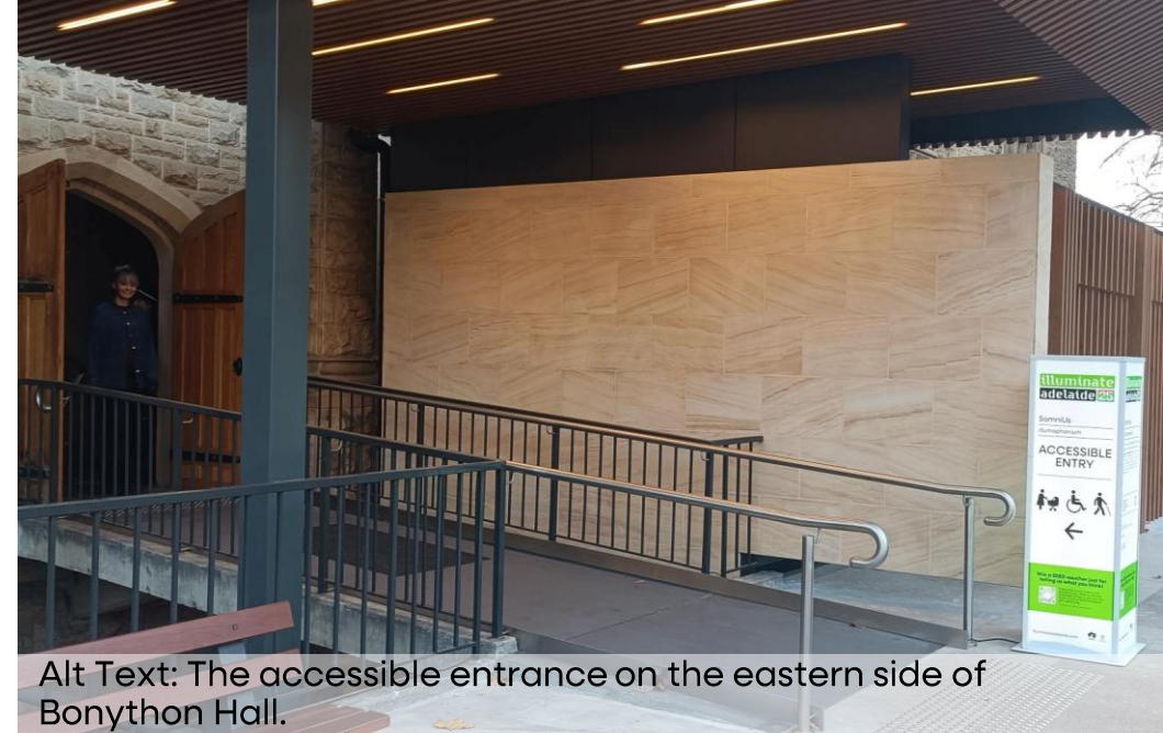
Alt Text: The accessible entrance on the eastern side of Bonython Hall.

Beside this entrance are accessible toilets.